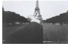
Title: Study of Perspective - Eiffel Tower Creator: Ai Weiwei Medium: Gelatin silver print Created Date: 1995-2003 Contributed Institution: The Museum of Modern Art https://www.moma.org/collection/works/117095