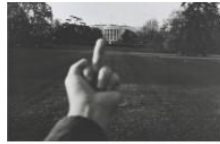
Title: Study of Perspective - White House Creator: Ai Weiwei Medium: Gelatin silver print Created Date: 1995-2003 Contributed Institution: The Museum of Modern Art https://www.moma.org/collection/works/117097