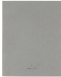
Title: The Grey Cover Book Creator: Ai Weiwei Medium: Artist's book Created Date: 1997 Contributed Institution: The Museum of Modern Art https://www.moma.org/collection/works/150072