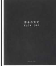
Title: FUCK OFF Creator: Ai Weiwei Medium: Exhibition catalogue Created Date: 2000 Contributed Institution: The Museum of Modern Art https://www.moma.org/collection/works/150073