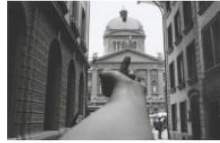
Title: Study of Perspective - Berne Creator: Ai Weiwei Medium: Gelatin silver print Created Date: 1995-2003 Contributed Institution: The Museum of Modern Art http://www.moma.org/collection/works/117099