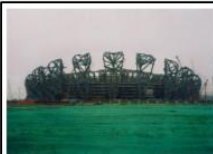
Title: No. 7 (Series: Bird's Nest) Creator: Ai Weiwei Medium: Photography Created Date: 2009 Publisher/repository responsible for object: Unknown http://www.artlinkart.com/en/artist/wrk_sr/196bzu/fc7arzn