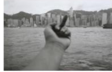
Title: Study of Perspective - Hong Kong Creator: Ai Weiwei Medium: Gelatin silver print Created Date: 1995-2003 Contributed Institution: The Museum of Modern Art http://www.moma.org/collection/works/117100