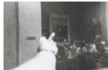
Title: Study of Perspective - Mona Lisa Creator: Ai Weiwei Medium: Gelatin silver print Created Date: 1995-2003 Contributed Institution: The Museum of Modern Art https://www.moma.org/collection/works/117094