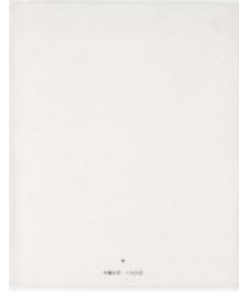
Title: The White Cover Book Creator: Ai Weiwei Medium: Artist's book Created Date: 1995 Contributed Institution: The Museum of Modern Art https://www.moma.org/collection/works/150071