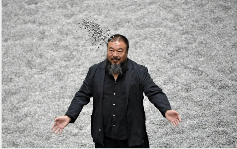
THE UNILEVER SERIES: AI WEIWEI: SUNFLOWER SEEDS 12 October 2010 - 1 May 2011, TATE Modern, London