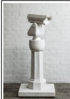
Title: Camera with Plint Creator: Ai Weiwei Medium: Marble Created Date: 2015 Publisher/repository responsible for object: Ai Weiwei Studio https://artsandculture.google.com/asset/camera-with-plint/kAEUaLLCHFARgA

Supplementing DPLA Objects Google Art & Culture, ARTLINKART, The Guggenheim Museums and Foundation