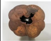
Title: China Log Creator: Ai Weiwei Medium: Ironwood Created Date: 2005 Publisher/repository responsible for object: The Guggenheim Museums and Foundation https://www.guggenheim.org/artwork/18758