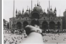
Title: Study of Perspective - San Marco Creator: Ai Weiwei Medium: Gelatin silver print Created Date: 1995-2003 Contributed Institution: The Museum of Modern Art https://www.moma.org/collection/works/117096