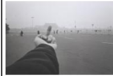
Title: Study of Perspective - Tiananmen Square Creator: Ai Weiwei Medium: Gelatin silver print Created Date: 1995-2003 Contributed Institution: The Museum of Modern Art https://www.moma.org/collection/works/117098