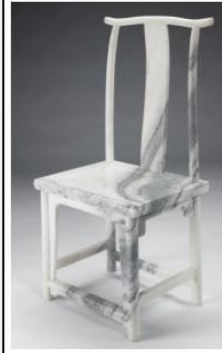
Title: Marble Chair Creator: Ai Weiwei Medium: Marble Created Date: 2008 Contributed Institution: Minneapolis Institute of Art https://collections.artsimia.org/art/109147