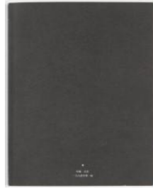
Title: The Black Cover Book Creator: Ai Weiwei Medium: Artist's book Created Date: 1994 Contributed Institution: The Museum of Modern Art https://www.moma.org/collection/works/150070